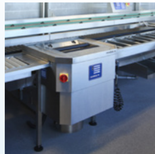
Integrated waste station